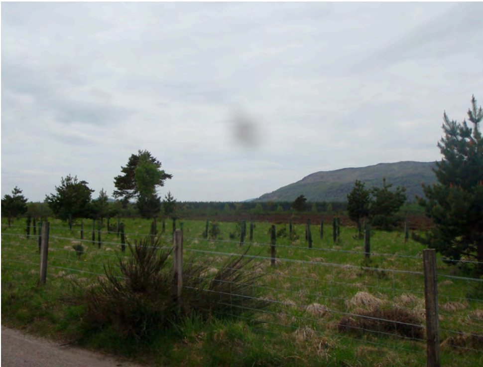
Fig. 14- View over site looking south from B970