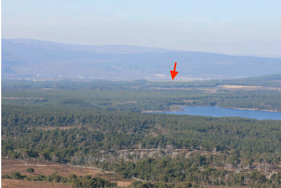
Fig. 5- View from Cairngorm Mountain