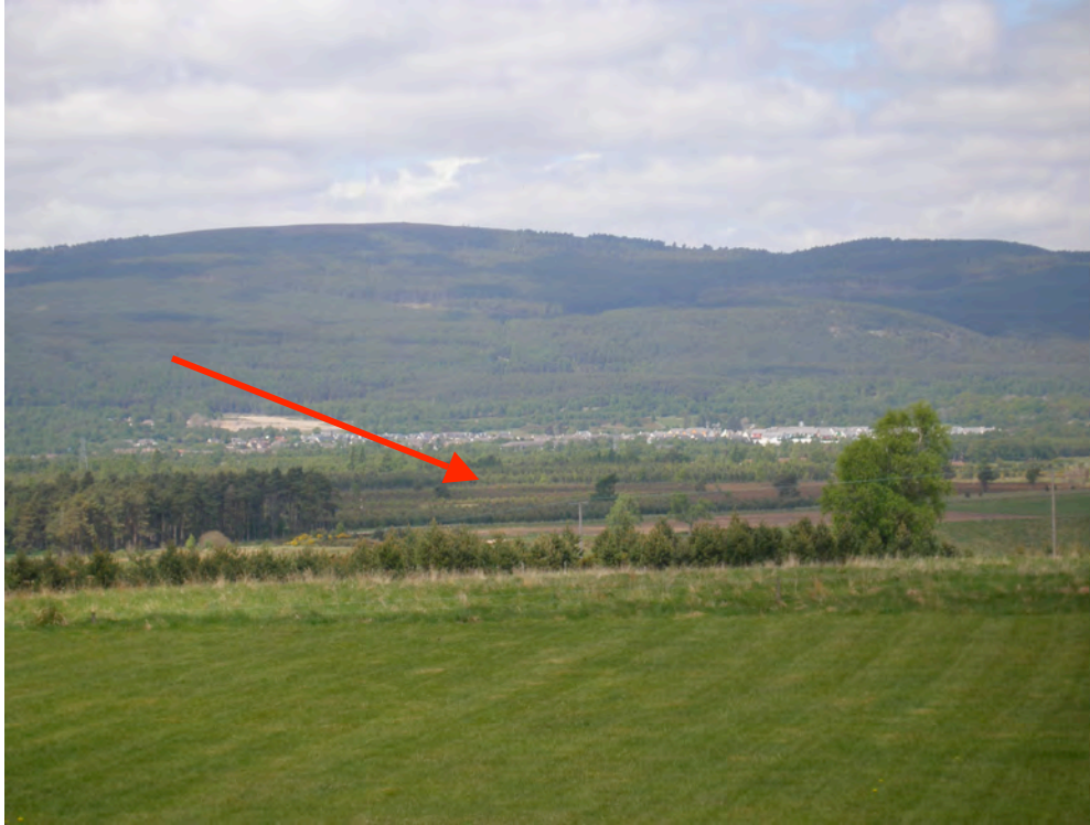
Fig. 7- View of site from high ground to east