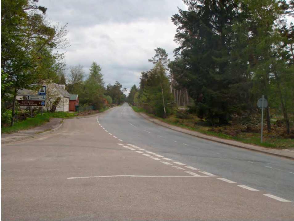
Fig. 11 View towards Glenmore at B970 junction