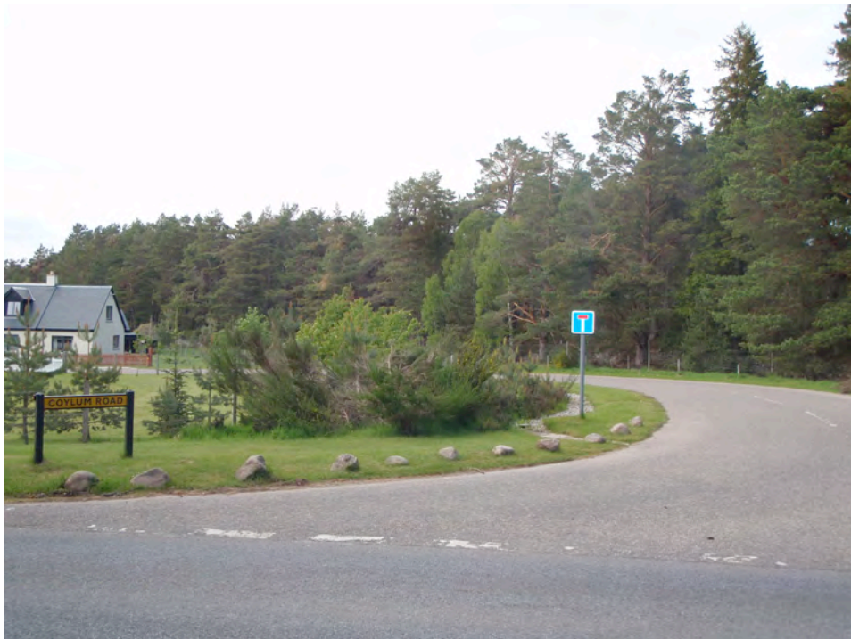
Fig. 12 View towards access Coylum Road