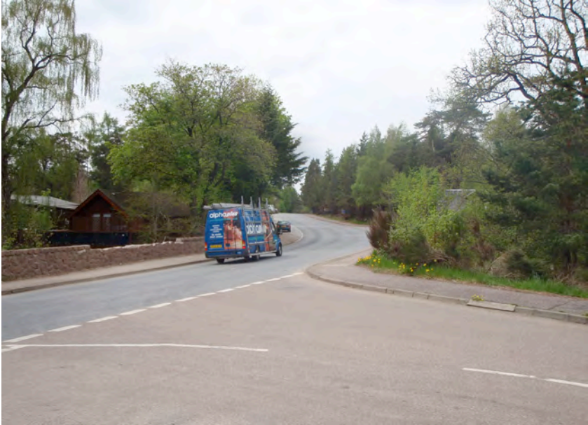
Fig. 10-View towards Aviemore Glenmore Road/B970 junction