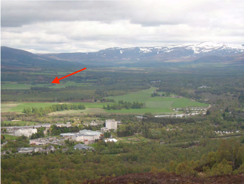
Fig. 2-View of southern end of site from Craigellachie