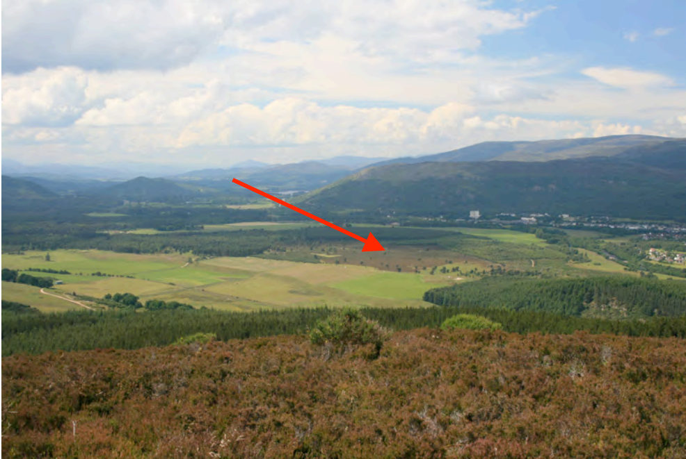
Fig. 3- View of site from Creag Pityoulish