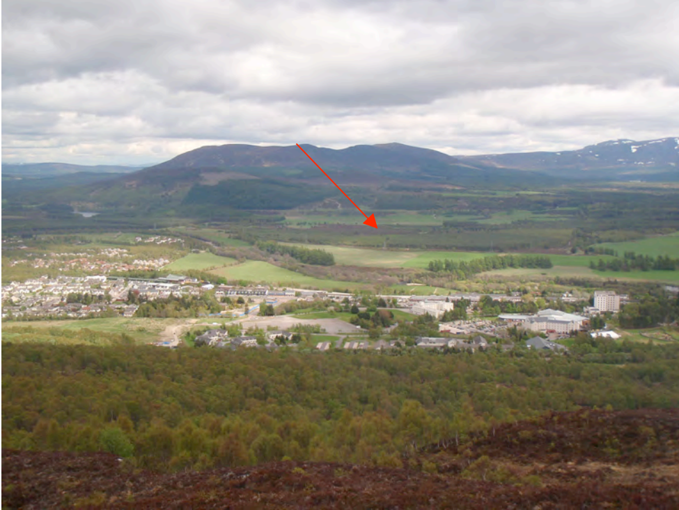
Fig. 1-View of site from Craigellachie