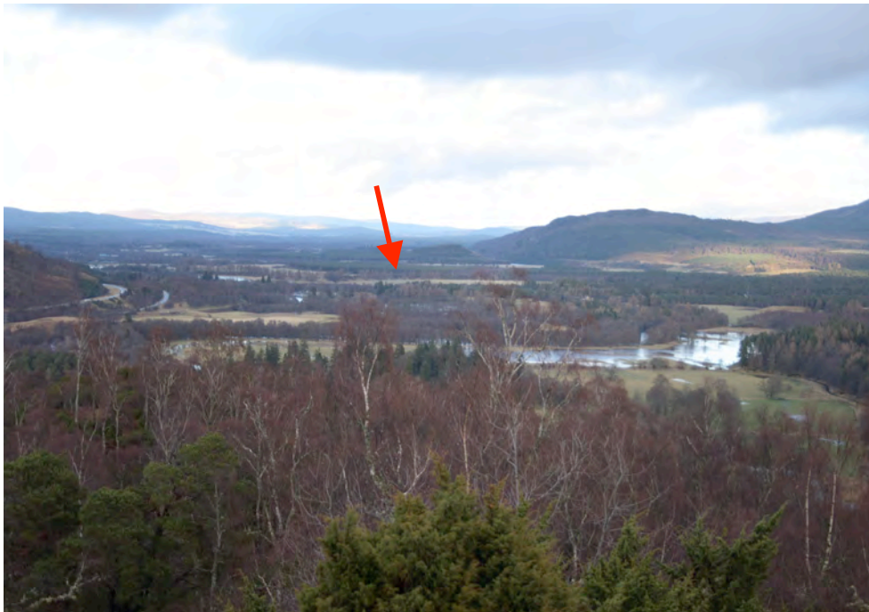
Fig.6 View from Gordon Monument