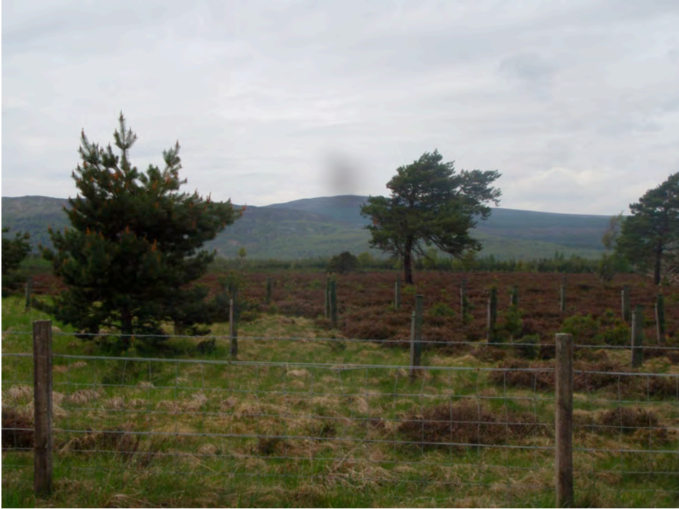
Fig. 13- View over site from B970