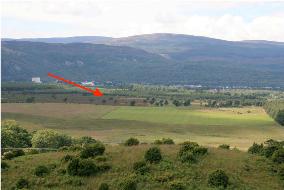
Fig. 4- View of site from route up Creag Pityoulish